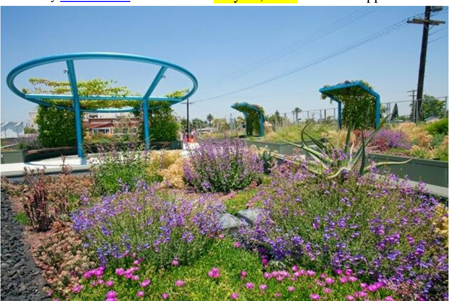
A drought-tolerant green roof garden in Los Angeles. These types of projects could get a boost from a better understanding of an accounting practice that allows public agencies to finance such projects as assets.

In the years to come, we're likely to see a lot more "green" and distributed infrastructure projects from water utilities, like permeable pavement, rainwater capture and efficiency rebates. That's because coming up with the money needed to scale these projects just got a lot easier.