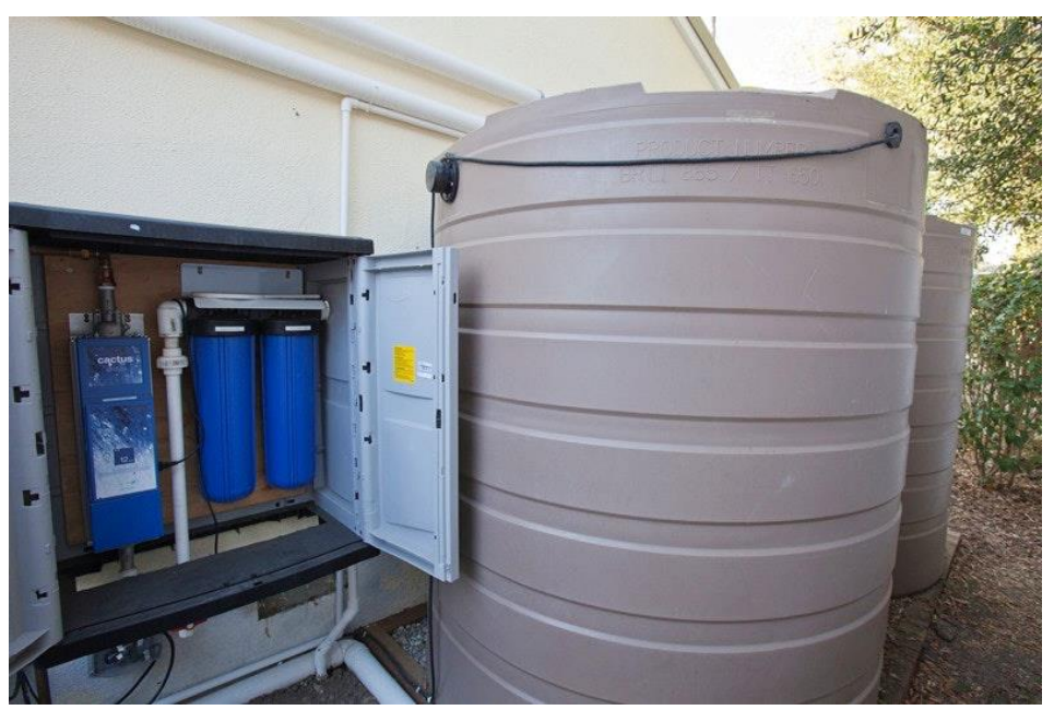
An 865-gallon rain barrel next to a water filter and micron filters for harvested rainwater on a green home in Los Angeles.

that are available and already in use in California and elsewhere around the world," the Pacific Institute found.