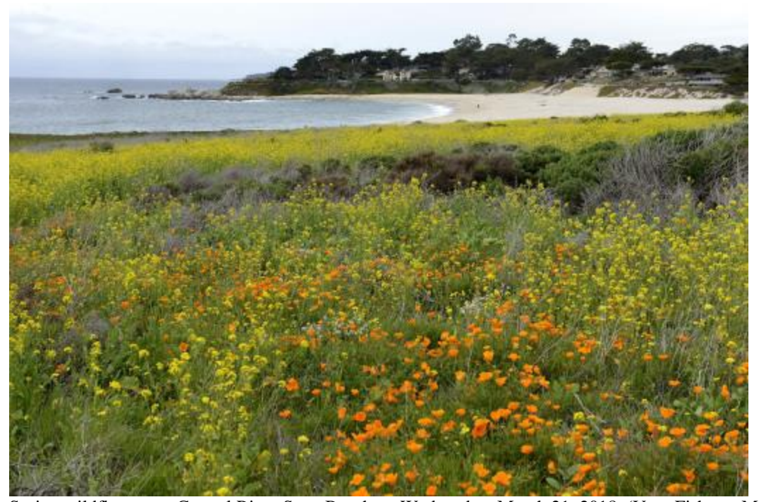
Spring wildflowers at Carmel River State Beach on Wednesday, March 21, 2018.

By <u>Paul Rogers</u> | <u>progers@bayareanewsgroup.com</u> | PUBLISHED: May 21, 2018 at 7:00 am | UPDATED: May 21, 2018 at 3:32 pm