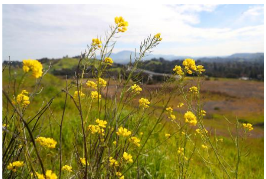
Mustard plants grown along the hillside of a proposed housing development site along Deer Hill Road on Wednesday, March 7, 2018 in Lafayette, Calif.

By <u>Jon Kawamoto | jkawamoto@bayareanewsgroup.com |</u> Bay Area News Group PUBLISHED: May 30, 2018 at 5:53 am | UPDATED: May 30, 2018 at 4:11 pm